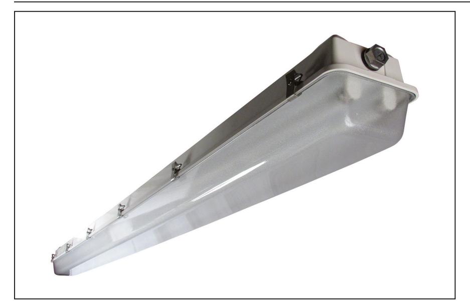
8ARD deep crepe lens, DC-2A end plug & LSS-3 stainless steel latches shown.